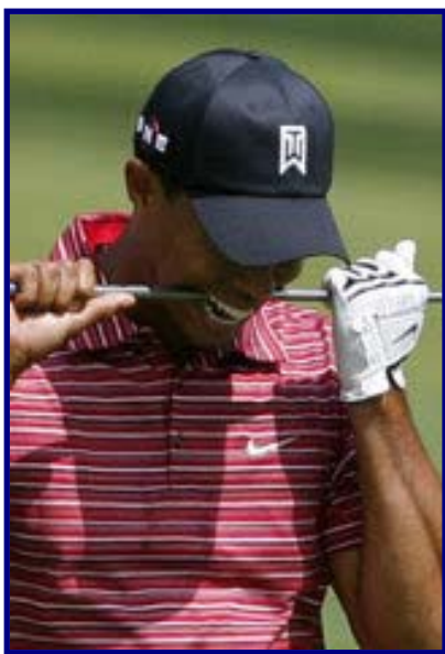
New Terrapin Czar?

SOUTHERN PINES, North Carolina, and WASHINGTON D. C. (DOD). – W hite House Press Secretary Robert Gibbs touched off a firestorm of controversy today by announcing that President Barack Hussein Obama intends to nationalize the Terrapin Travelin' Trophy. Known to its aficionados as "The Turtle," the Trophy is awarded annually to the winner of the Southern Pines Invitational Golf Trip Tournament. It is universally recognized as the most desired trophy in sport. In a move that symbolizes fairness, Gibbs said the President would call upon Congress to mandate the distribution of Turtle replicas to all Americans.