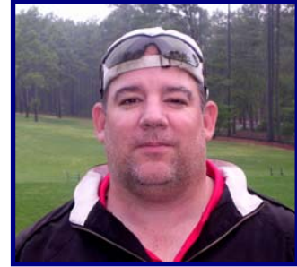
A Moving Day Favorite.

Day Three at Pine Needles is always Moving Day. The theory is that Pine Needles is the more playable of the two courses. After the players have two rounds under their belts, they have a feel for the Pine Needles greens. This often results in large point swings on Day Three. This phenomenon normally does not manifest in the Day Four rounds on the tougher greens at Mid Pines. Moving Day 2010 proved out this theory, but was also the strangest day in recent Golf Trip memory.