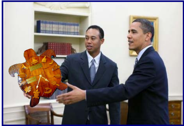
Woods may have piqued the President's interest in the Turtle.

Rumors swirled around Washington about the source of the President's interest in the Turtle. Some speculated that the President's desire was piqued after he stumbled across dimpledorbn.net , the official website of the Southern Pines Invitational, while websurfing during a Hawaiian vacation. Others attributed the desire to a recent meeting with Woods. According to an Oval Office insider who requested anonymity, Woods whetted the President's appetite for the Turtle by showing the President a Faux Turtle during the meeting, while describing the Reptile's notoriety. Given Woods' recent marital difficulties, and the now remote possibility of Woods ever claiming the Trophy, speculation is rife that President Obama desires to fill that void himself. Regardless of the source of the President's interest in the Turtle, today's announcements cast a pall over the normally ebullient participants in the Southern Pines Invitational.