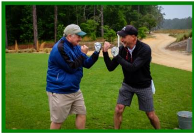
Mano-a-mano never materialized.