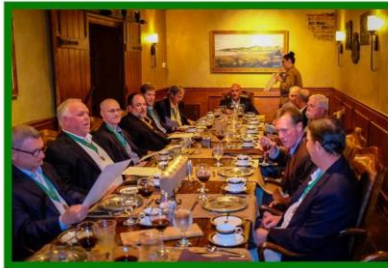
Dinner in the Cellar.