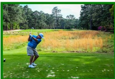
Stone Cold couldn't catch Tiger.