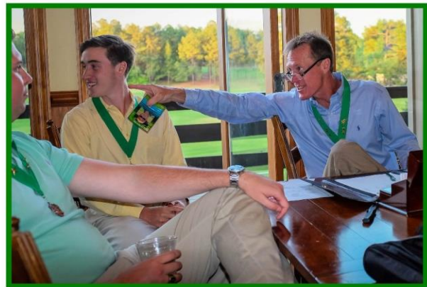
The new guys stayed close to the Chairman.