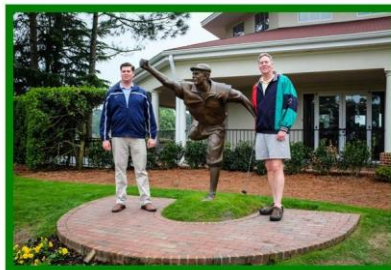
Payne Stewart statue.