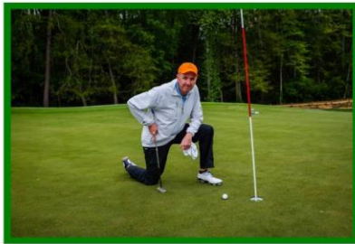
Gibson nearly holed out.