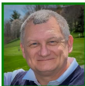
The Total Package