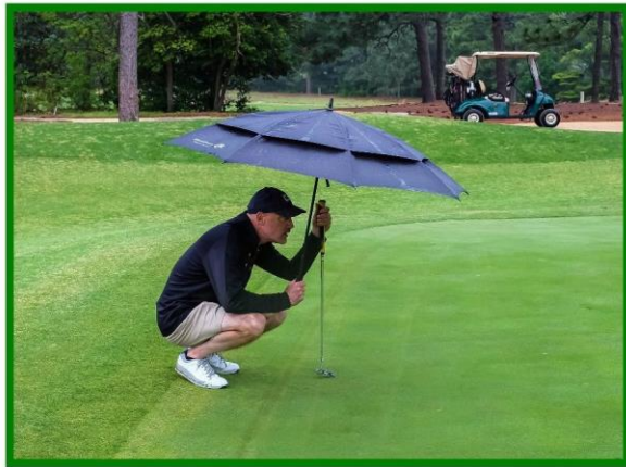
Day Three saw rain.