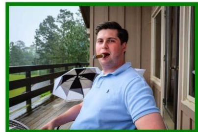
Cigars on the deck.