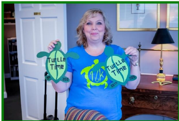
Preparations for the festivities.