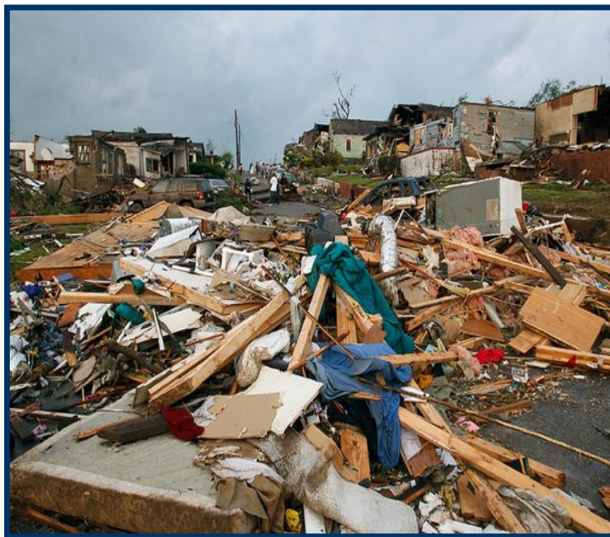
.... leaving destruction behind.