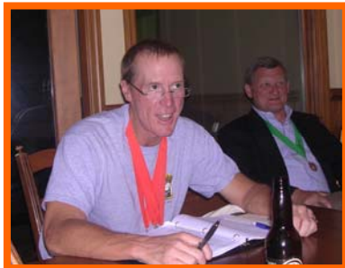
Tour de force.