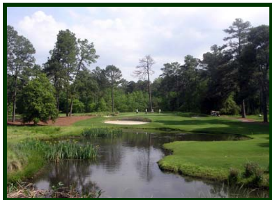
The weather was beautiful after the storms.

Day one of the Tournament opened with a steady rain caused by the lingering storms in the aftermath of the tornadoes. Pine Needles closed shortly before the scheduled 1:00 pm start time. All the golfers that had been on the course were called in to await the resumption of play, which finally occurred with a shotgun start at about 1:30. A softened course helped many in the field, while others struggled. The weather actually turned quite pleasant, and by the turn the players could hardly tell that it had rained at all on the well-drained course.