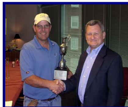
The Templeton Cup appeared briefly.