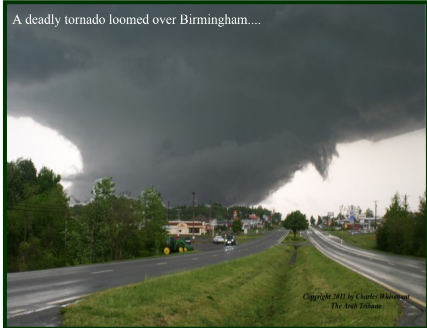
A deadly tornado loomed over Birmingham....