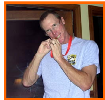
The Chairman tests his medal.