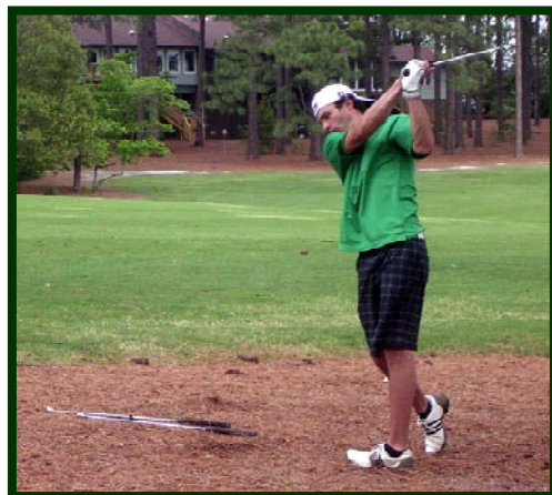
The Assassin struggled on the hallowed grounds.

Bringing up the rear at minus 7 were the Package, Lawler, and the Assassin, who suffered the fate of so many first timers with overly enthusiastic beginning quotas. As Wood dryly observed before the Tournament, "Everybody plays well at home....we can all turn into Rory McElroy on the hallowed grounds of Pine Needles." The other contestants ranged from Logue's plus 1 to Piledriver's minus 4.