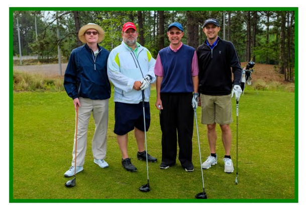
A chill was in the air at the start of Day Two

Day Two opened on Mid Pines under an overcast sky with a hint of fog in the air. Scoring conditions seemed ideal, but the performance by the field belied that impression. Only three players managed positive points on the day. Moore easily outpaced the field at plus 6 to win the Day by 5 and grab the overall lead. Loguemeister scratched out a plus 1 to find himself even after two Days. Tiger Thompson was the only other player on positive ground at plus 1. But that coupled with his Day One minus 4 could get him no purchase in the overall standings. Matlock's minus 2 left him at plus 6, a stroke behind Moore. Depot Stove's minus 1 and Templeton's minus 2 left them tied for third at plus 4. Mayhem had one of the worst rounds ever recorded by someone who actually finished the round. His 2 points were reminiscent of the Myrtle Beach days when, legend has it, the Calcutta Chairman was known to use a putter off the tee.