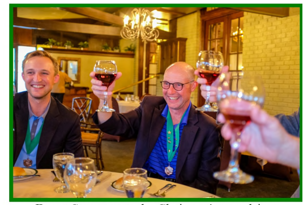
Depot Stove toasts the Chairman's new driver